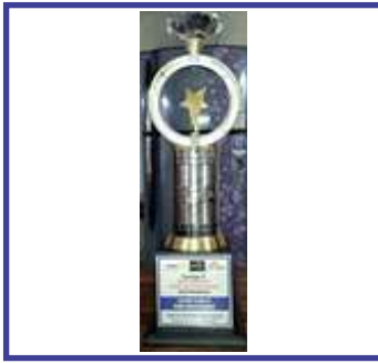
2nd Prize for Cancer Awareness