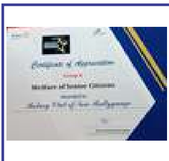
Certificate of Appreciation in Welfare of Senior Citizen