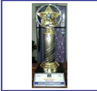
2nd Prize for News Letter