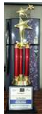
1st Prize - Concern for Intellectually Challenged

We meet twice a month (preferably Saturday/Sunday) online / in person