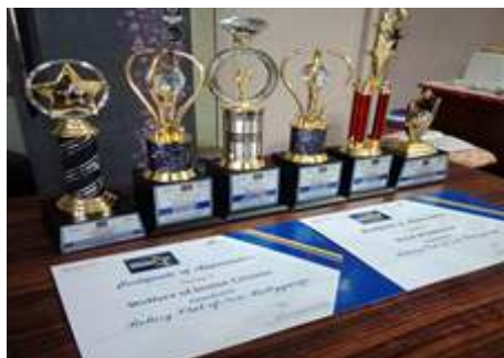
All Awards with Certificates

RC New Ballygunge received 6 Awards & 2 Certificate of Appreciation on 17th August 2025 at Dhano Dhanyo Auditorium (Category : Membership upto 20) as follows :