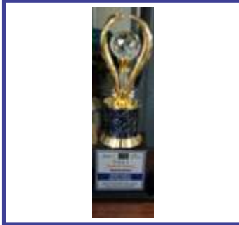
2nd Prize for Youth & Interact