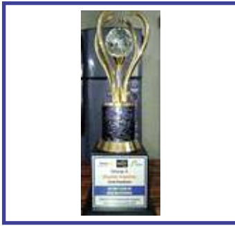
2nd Prize for Disaster Response