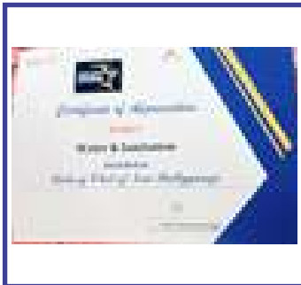
Certificate of Appreciation in Water & Sanitation