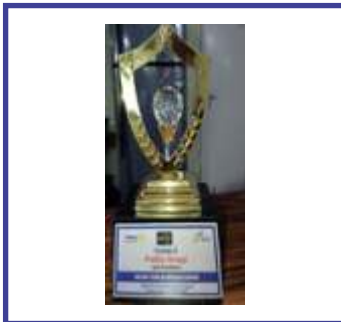
3rd Prize for Public Image